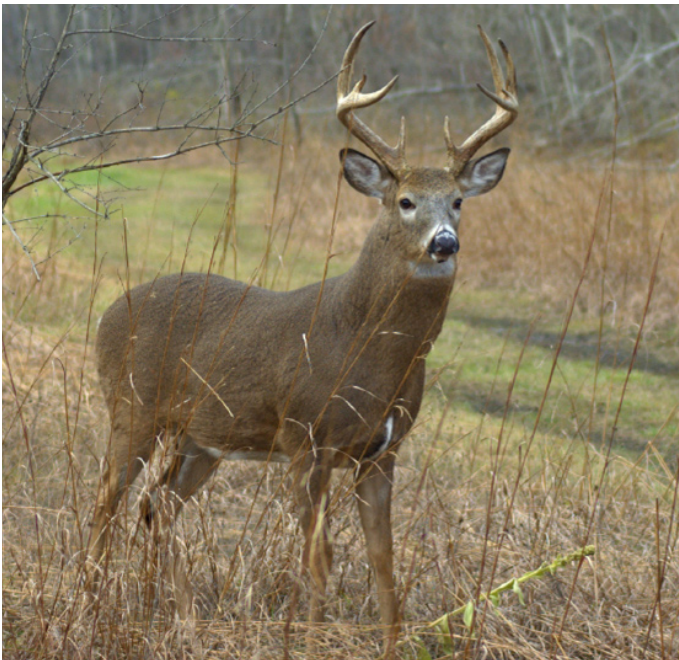
Deer and other wildlife can become ill after eating contaminated feeds offered by well-meaning humans.