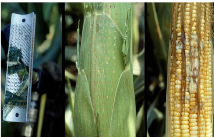
Inoculations to measure resistance are very labor intensive.

The goal is to develop a Corn Aflatoxin Risk Index (CARI). Since the initial work in this area was conducted, the landscape has changed requiring a possible reprioritization of factors that can influence aflatoxin contamination. These factors include: planting date, varietal maturity, varietal resistance, husk coverage, insect resistance, drought resistance, kernel composition, specific transgenic traits, row