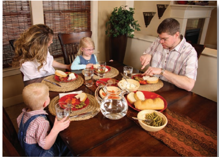
Meeting the goal of an ample, affordable and safe food supply.

The economic impact of aflatoxin contamination is difficult to measure, but the following losses have been documented. From 1990 to 1996, litigation costs of $34 million from aflatoxin contamination occurred. In 1998, corn farmers lost $40 million as a result of aflatoxin contaminated grain. In 2002, 30 million bushels of corn were discounted more than 25 percent. Millions of dollars are paid annually from crop insurance to corn growers who are adversely affected by having aflatoxin contaminated grain. In 2008, more than $15 million was paid out for crop losses due to aflatoxin contamination in corn. Every year where stress environments more frequently occur, corn is rejected at elevators because of the high level of aflatoxin contamination. As of now, the average direct loss is estimated at